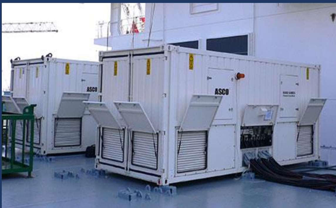
Replace by free shutterstock image of load bank

Load banks are units that can carry a high electrical load and, as a consequence, vent heat into the environment. They are often installed outside of an industrial facility and connected permanently to a power source or, on occasion, portable versions can be used for the purposes of testing these power sources and assessing local energy demand.